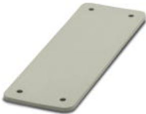
HEAVYCON cover plate, for panel cutouts of type B16/HV6, 3.5 mm thick, gray

Please be informed that the data shown in this PDF Document is generated from our Online Catalog. Please find the complete data in the user's documentation. Our General Terms of Use for Downloads are valid ( http://phoenixcontact.com/download )